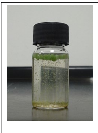
Fig. 1 Sample with algal cells visible, accumulating at the top of the vial

An example of the appearance of a low biomass freshwater sample is shown below: